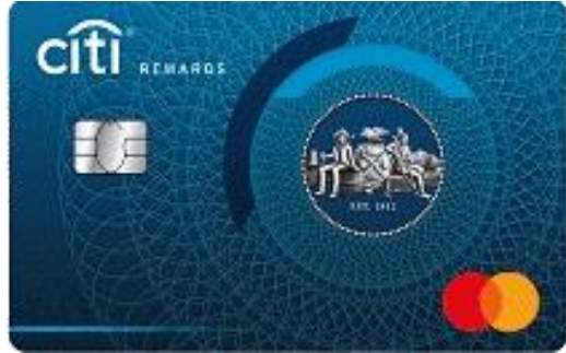
City Rewards Credit Card