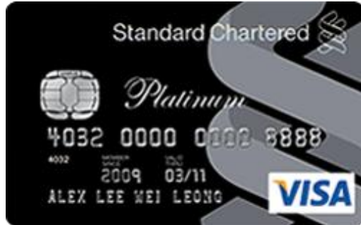
Platinum Rewards Credit Card