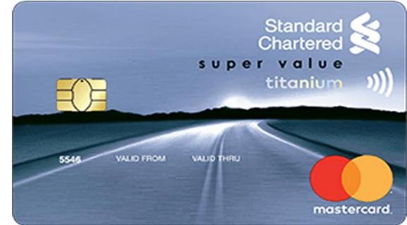
Super Value Titanium Credit Card

For More info contact us @ +91-7267060773, 0522-4339005