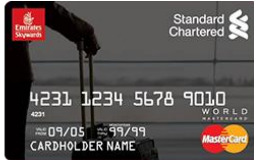
Emirates World Credit Card