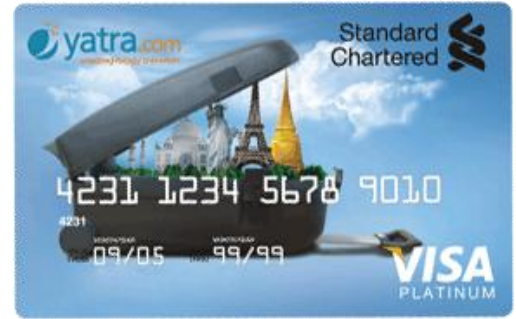
Yatra Platinum Credit Card

For More info contact us @ +91-7267060773, 0522-4339005