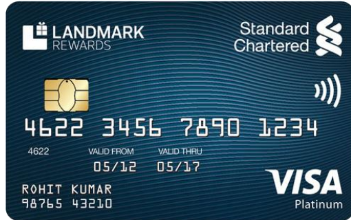
Landmark Rewards Platinum Credit Card