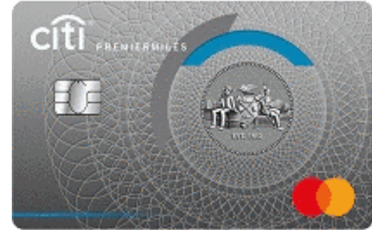
Citi PremierMiles Credit Card

For More info contact us @ +91-7267060773, 0522-4339005