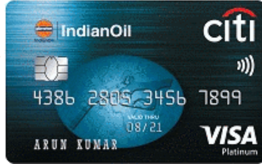
Indianoil Citi Credit Card