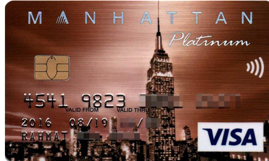
Manhattan Platinum Credit Card